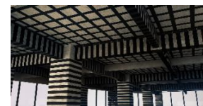
Curing and protecting