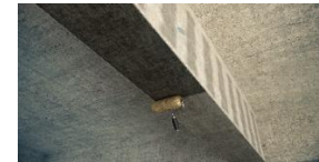
Applying epoxy resin adhesive