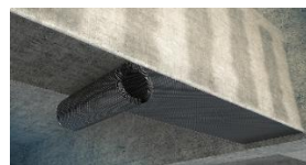
Pasting carbon fiber cloth